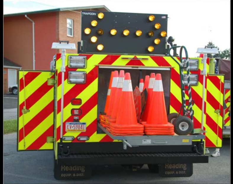
(PA) Gettysburg Fire Dept.