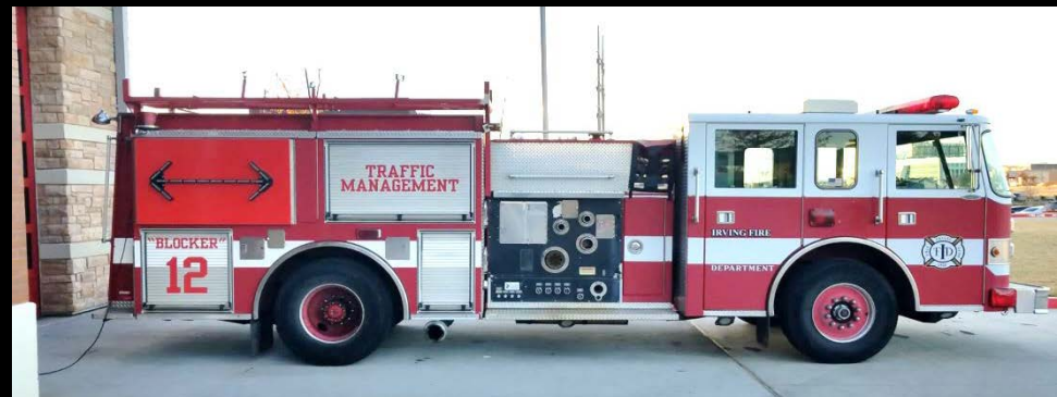
(TX) Irving Fire Dept.