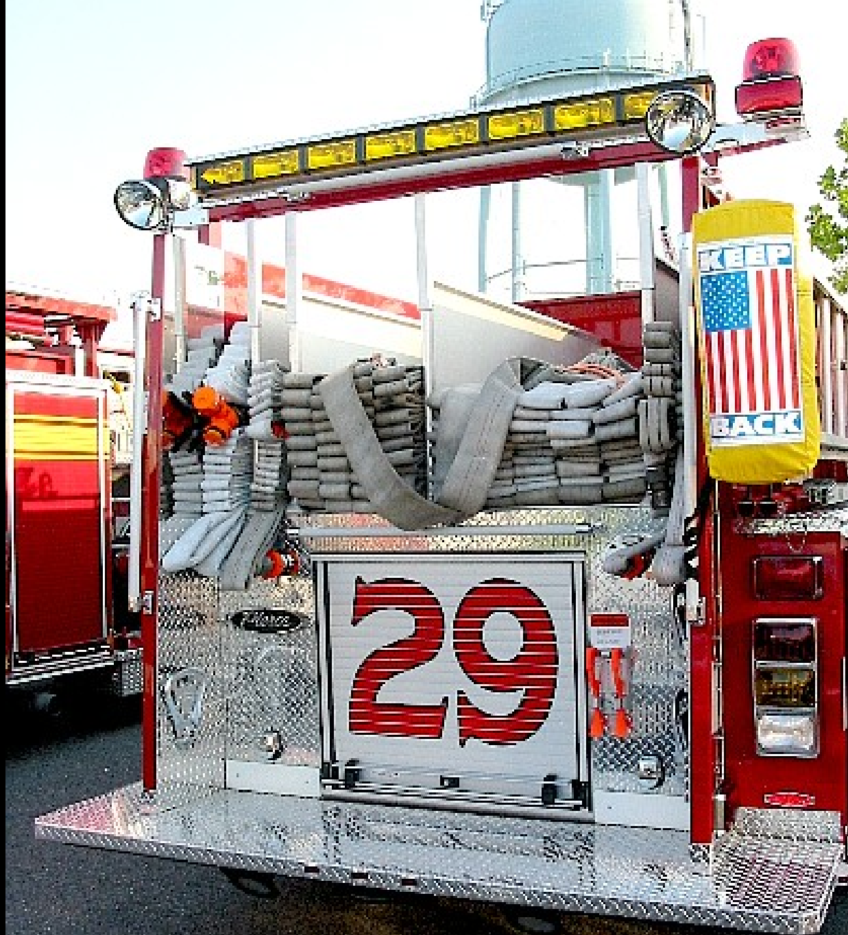
Silver Hill, MD Eng - 291