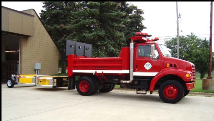
(MI) Grand Rapids Fire Dept.