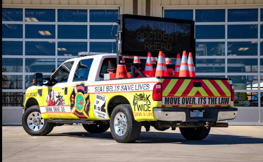
(SC) Howe Springs Fire Dept.